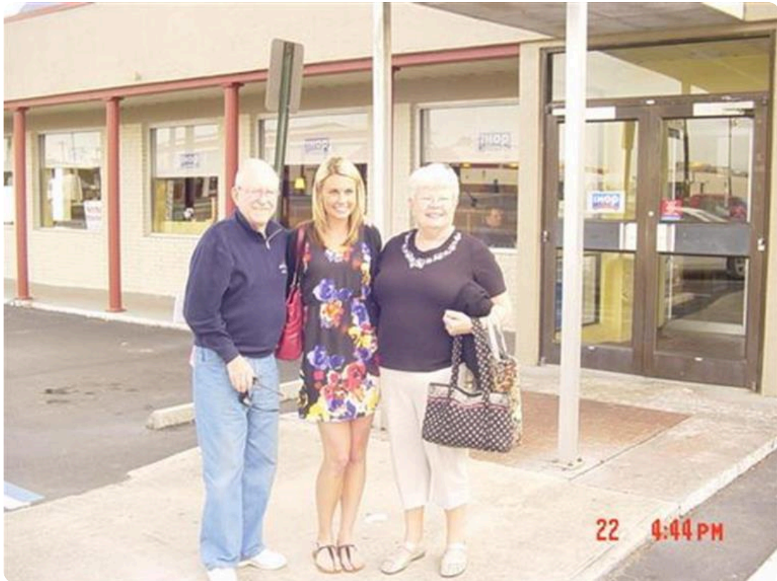
You will be missed.